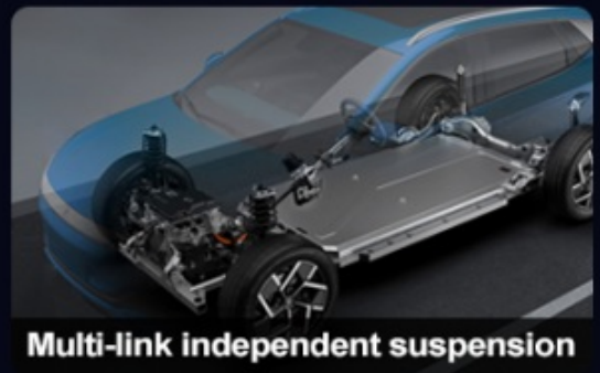
Multi-link independent suspension