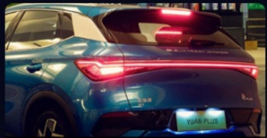
Through-through LED tail light