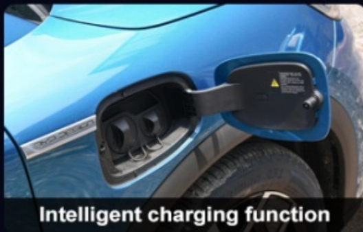
Intelligent charging function