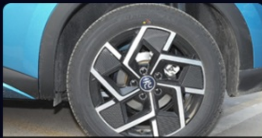
18 inch aluminum alloy wheel